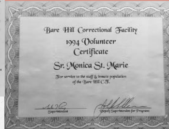
Page 4 — North Country Catholic — February 8, 1995