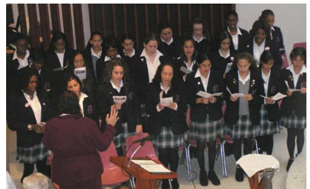
The choir sings a rousing rendition of MSU's Alma Mater.