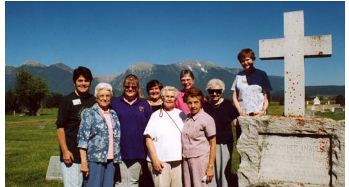
Ursulines and Associates under Montana's big sky

The Montana workshop explored the heritage of our missionaries in the state and was enriched this year by the presence of four Ursuline Associates from the East,