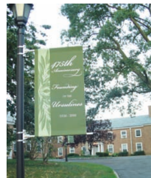
Laurel banners at the Province Center

The warmth of the interaction among those joining in this celebration expressed a joyful community among friends of the Ursulines. Take-home favors of small desk calendars with pictures of Ursuline activities and places convey the message of