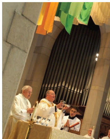
Archbishop Timothy Dolan, Celebrant, 475th Anniversary Mass