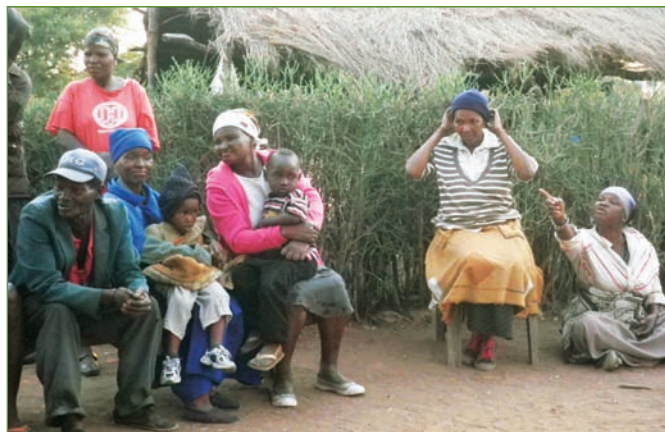
During our visit in Botswana we were invited to a dinner with this bush family.