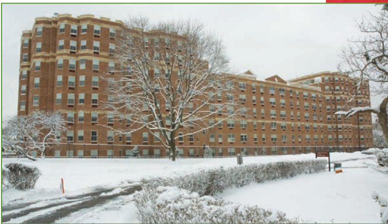
Left: Let it snow! Shot taken from interior of campus on February 21 when 4 inches were added to the 56 which had fallen since December 27.